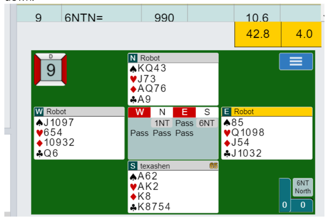
N 1NT (15-17 hcp)

Taking advantage of a common defensive mistake to make a slam that should go down.